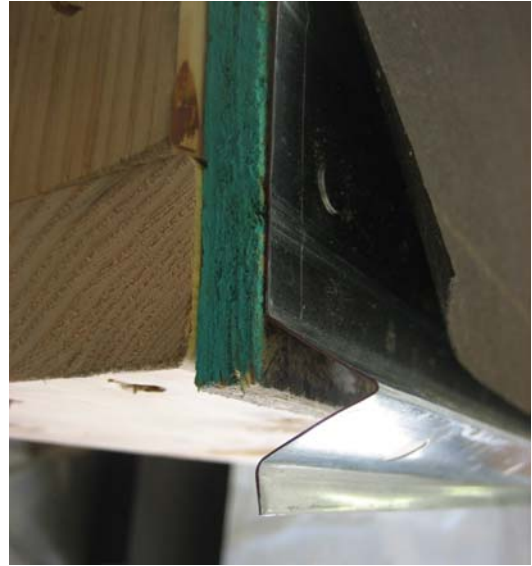
Fig. 2 – Wall sill detail

with the weep screed. The rainscreen system terminated at the weep screed and a weeped metal casing bead or other weeped trim channel was installed at the bottom of the rainscreen system (Fig. 3).