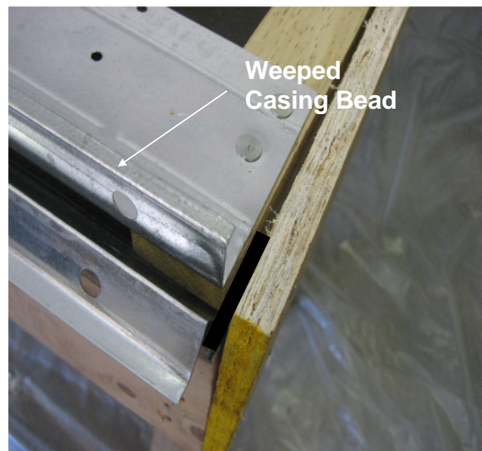
Fig. 3 – Weeped casing bead detail.